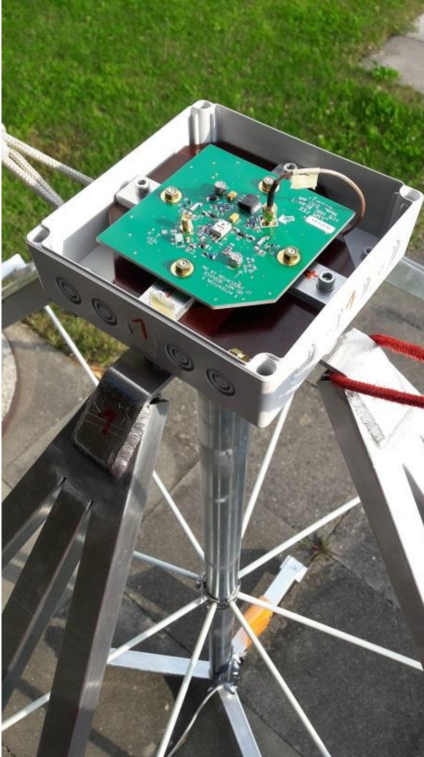
Fig. 4: Waterproof plastic box containing electronics (LWA-FEE from Reeve engineering Anchorage). 4 bolts provide electrical connection between printed circuit board and dipoles. Here only one SMA cable is connected for demonstration and testing.