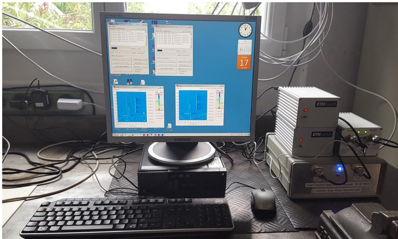
Fig. 7: Control PC, 2xCallisto, quadrature hybrid and power supply (LWAPC-Q from Reeve engineering Anchorage), below dual channel heterodyne converter, built by Peter H.