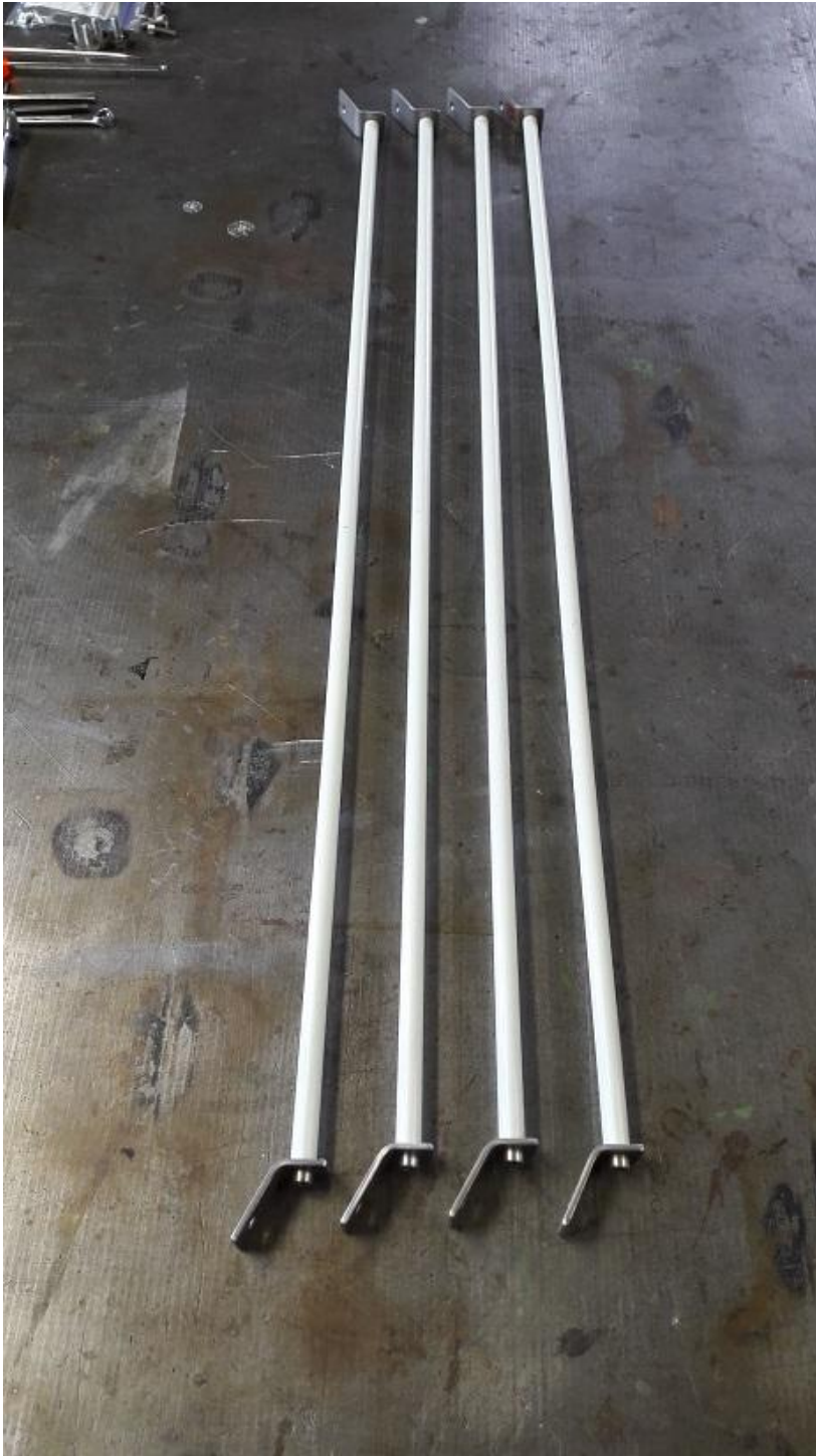
Fig. 5: Plastic rods from a farmers shop used to fix the dipoles on the central rod.