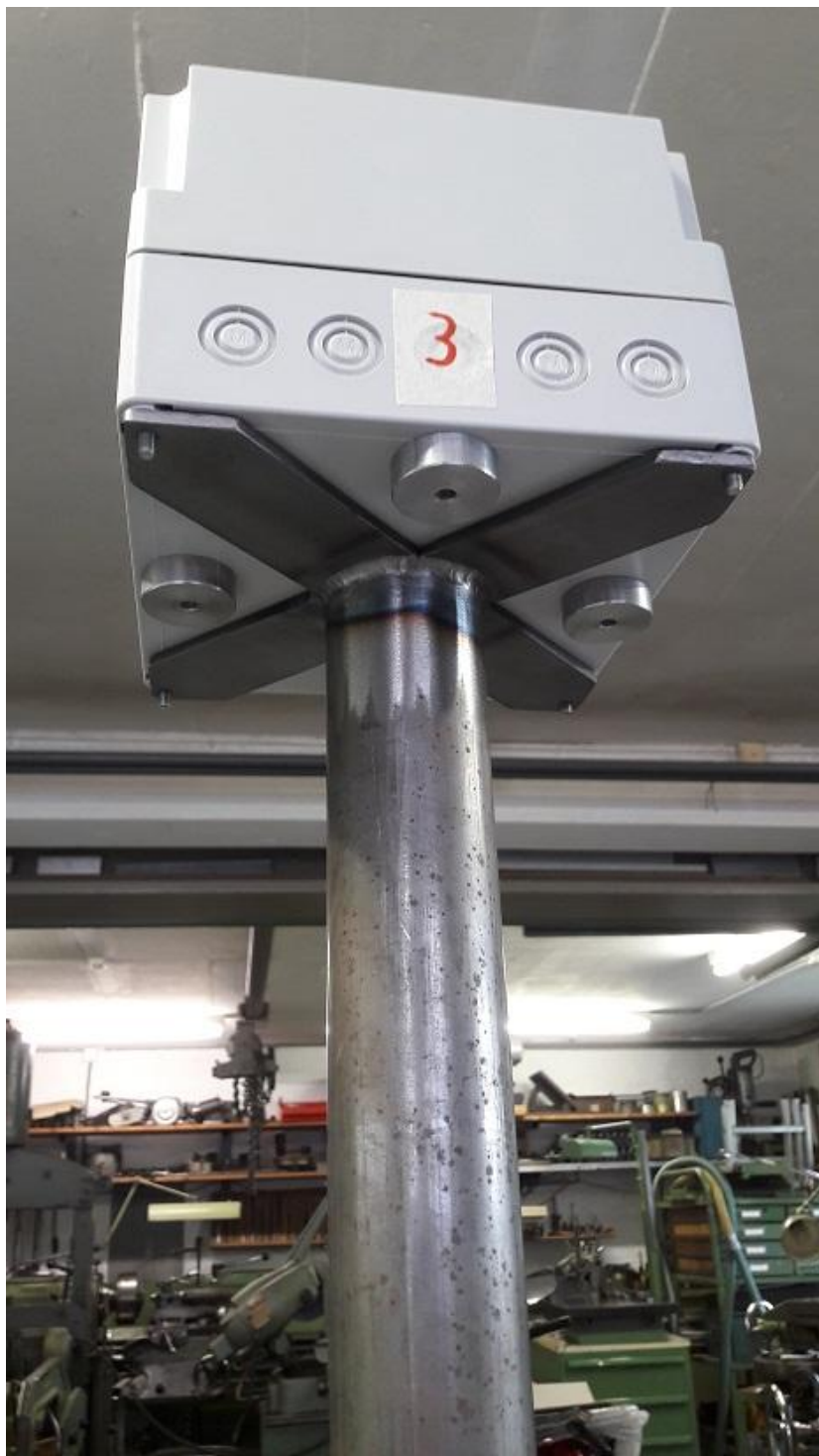
Fig. 3: Central mast made of steel, carrying the waterproof plastic box to host the low noise amplifier electronics (LWA-FEE).