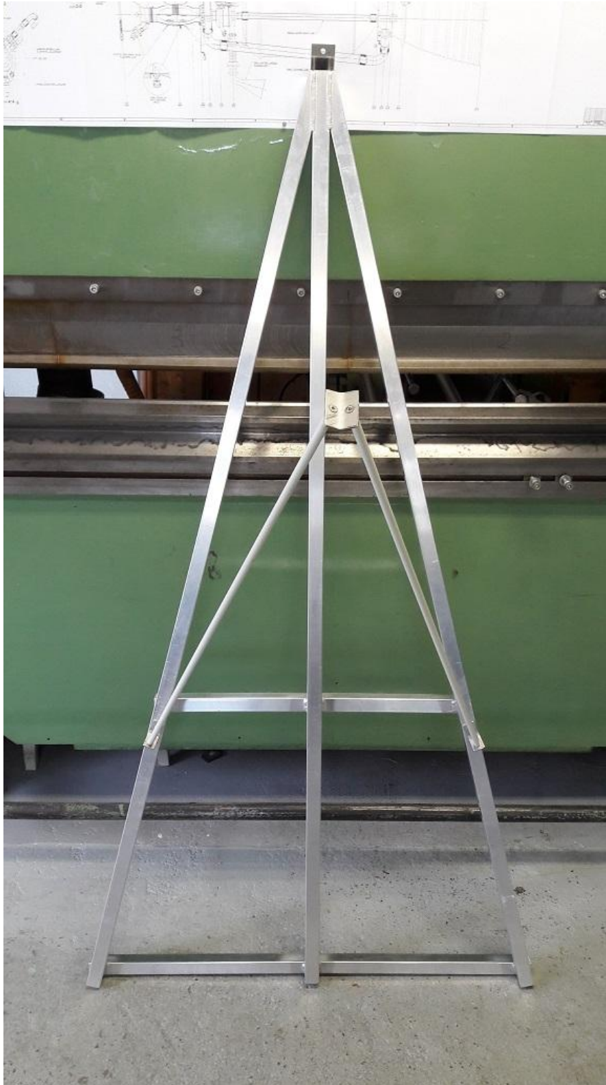
Fig. 2: First half dipole ready welded. Four of this wings are required to get a full dual polarization LWA.